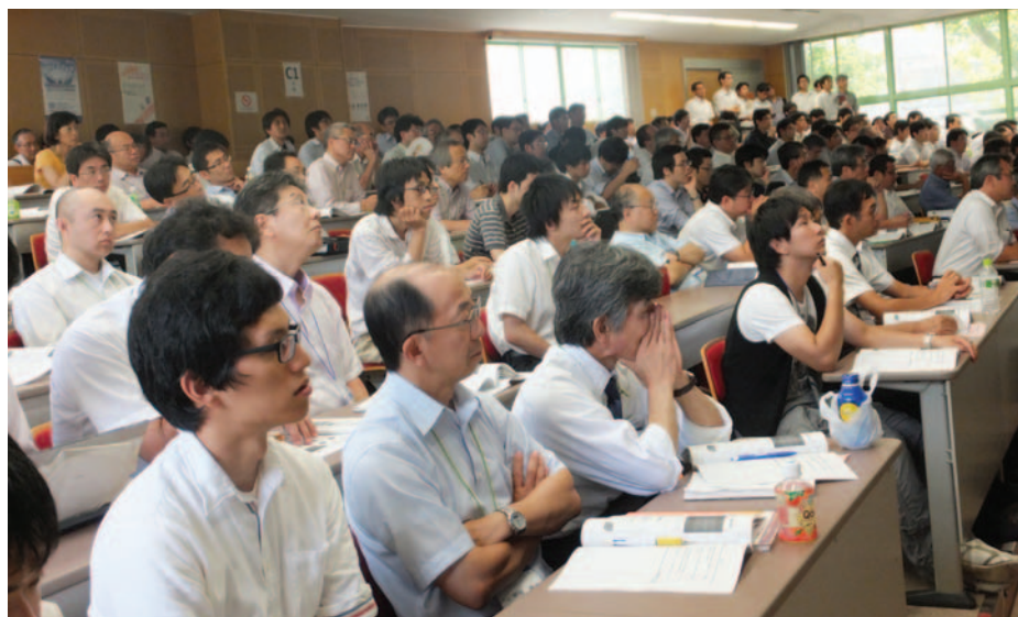
Around 5,700 participants attended the Autumn Meeting of JSAP 2012, which was co-hosted by Ehime and Matsuyama Universities.

"It is difficult to achieve conversion efficiencies of more than 25% by using conventional silicon-based solar cells because silicon cannot absorb the spectrum of natural sunlight from 1.4 to 1.7 eV, where a fair amount of the energy is distributed," Konagai pointed out. Devices based on silicon